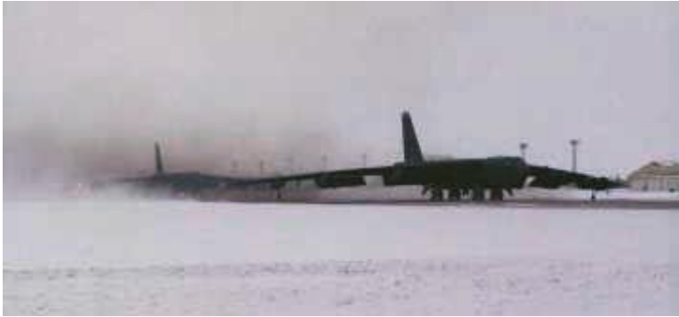
B-52s perform minimum interval takeoffs in response to tactical warning.

possible that communications may be degraded to the point that it is difficult to pass critical information or send orders to the field.